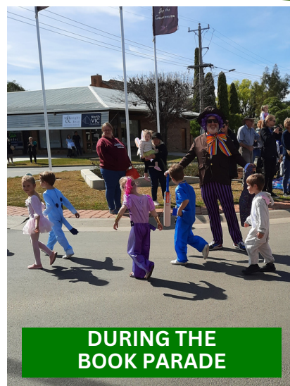
DURING THE BOOK PARADE

Enrolment enquiries are welcome and interested families are asked to contact the school office on (03)54521426 or admin@sjkerang.catholic.edu.au